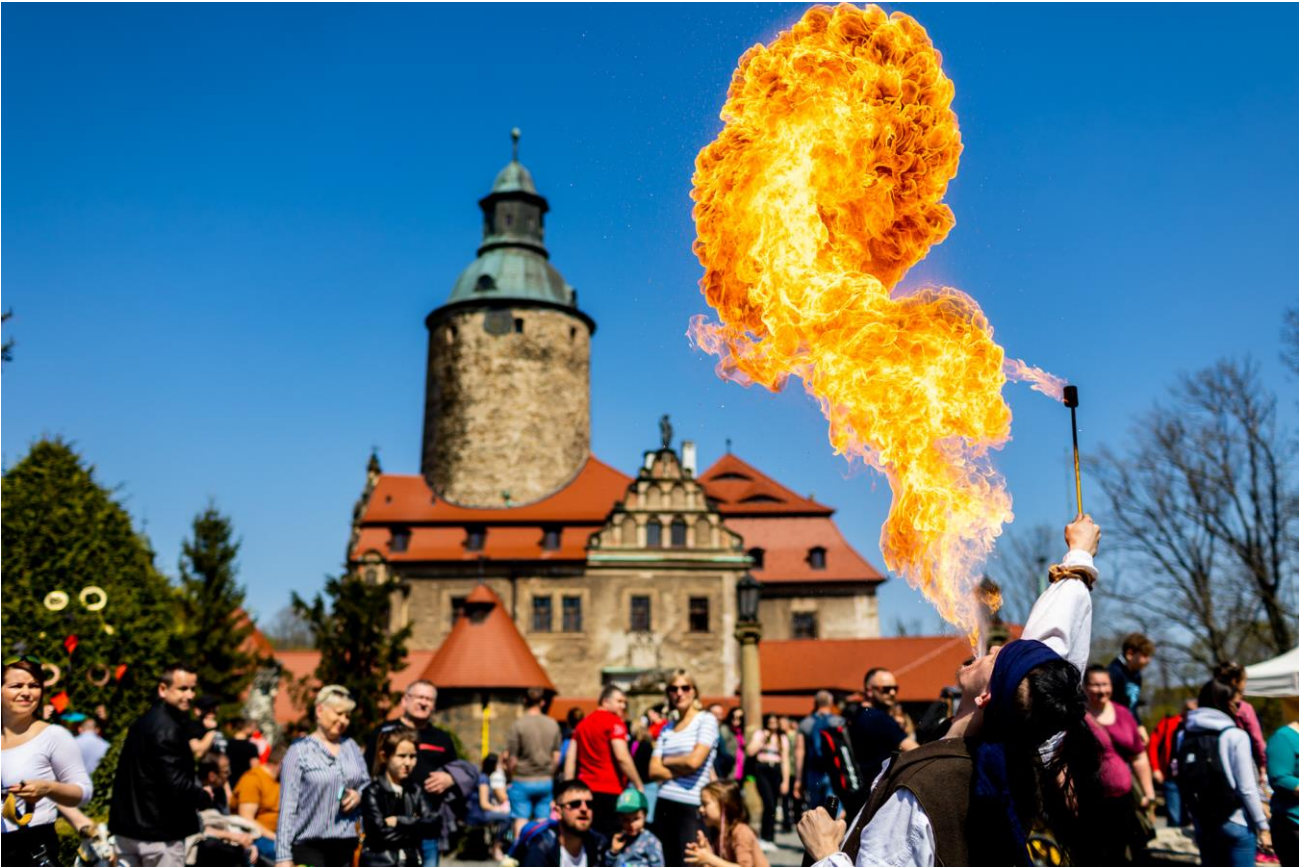
An event on the castle courtyard