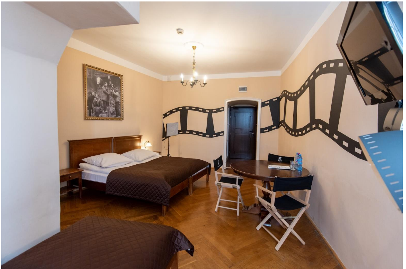
3 person superior room