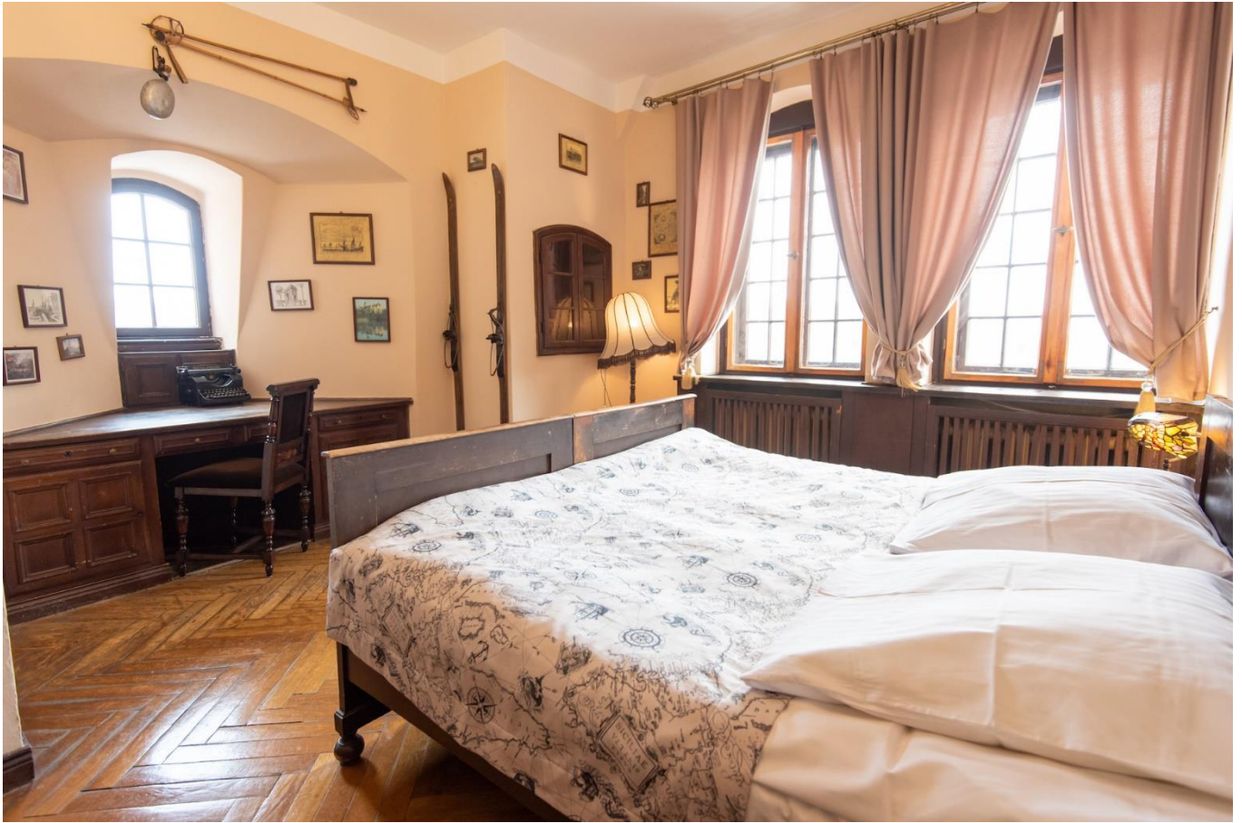
2 person superior room