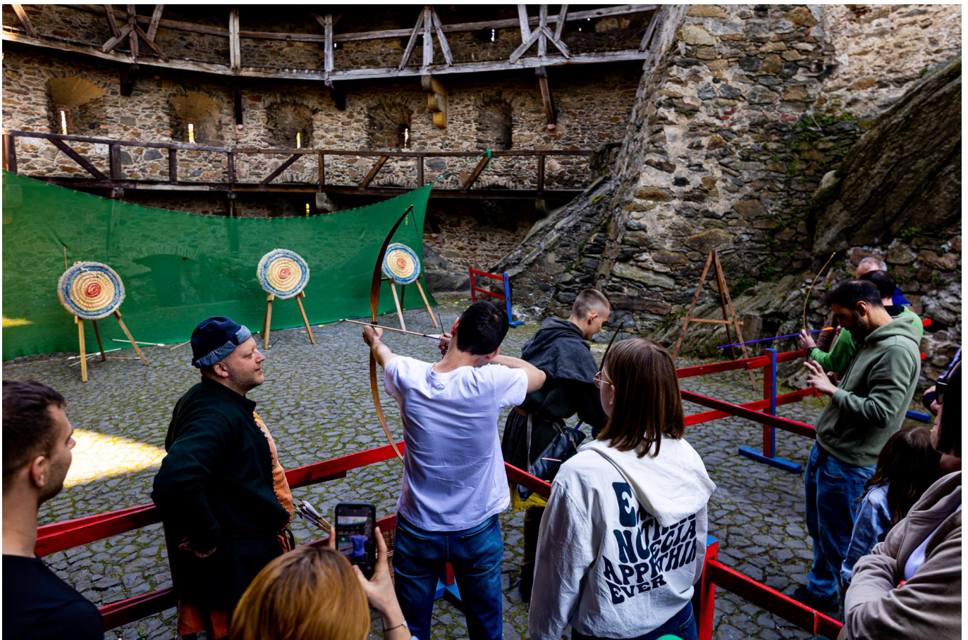
Archery on the castle courtyard