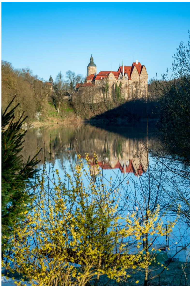
Tschocha Castle – general view