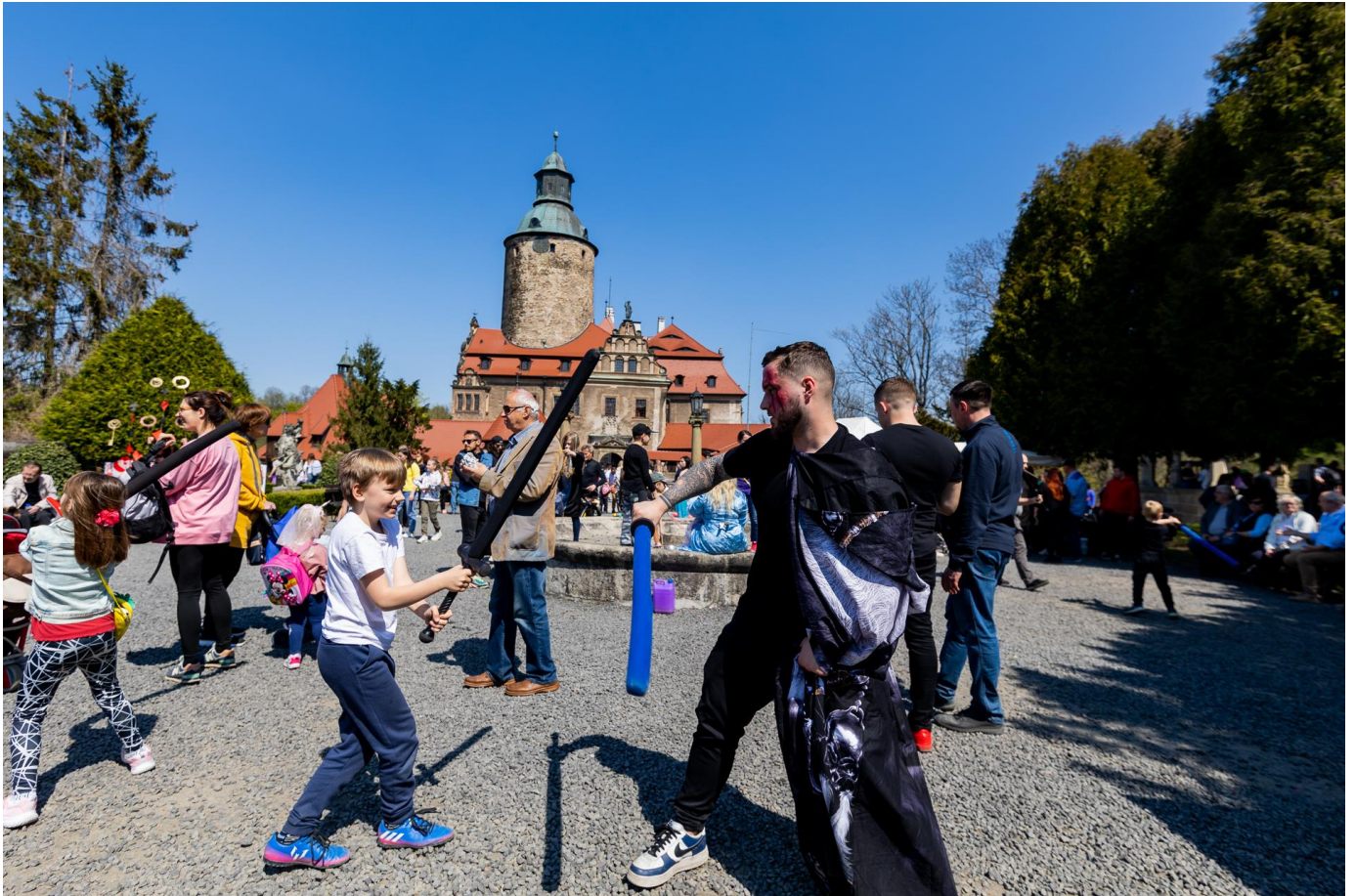
Fun with kids