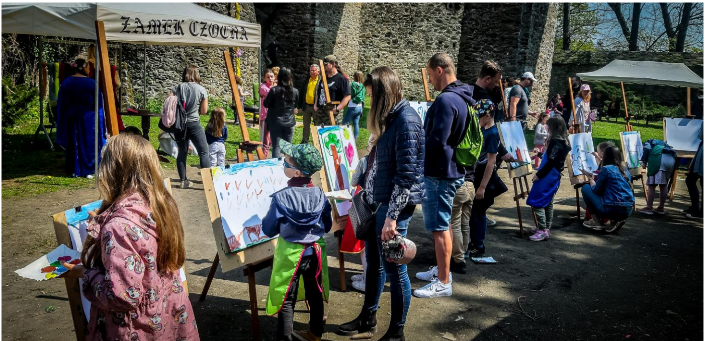
Activities for children