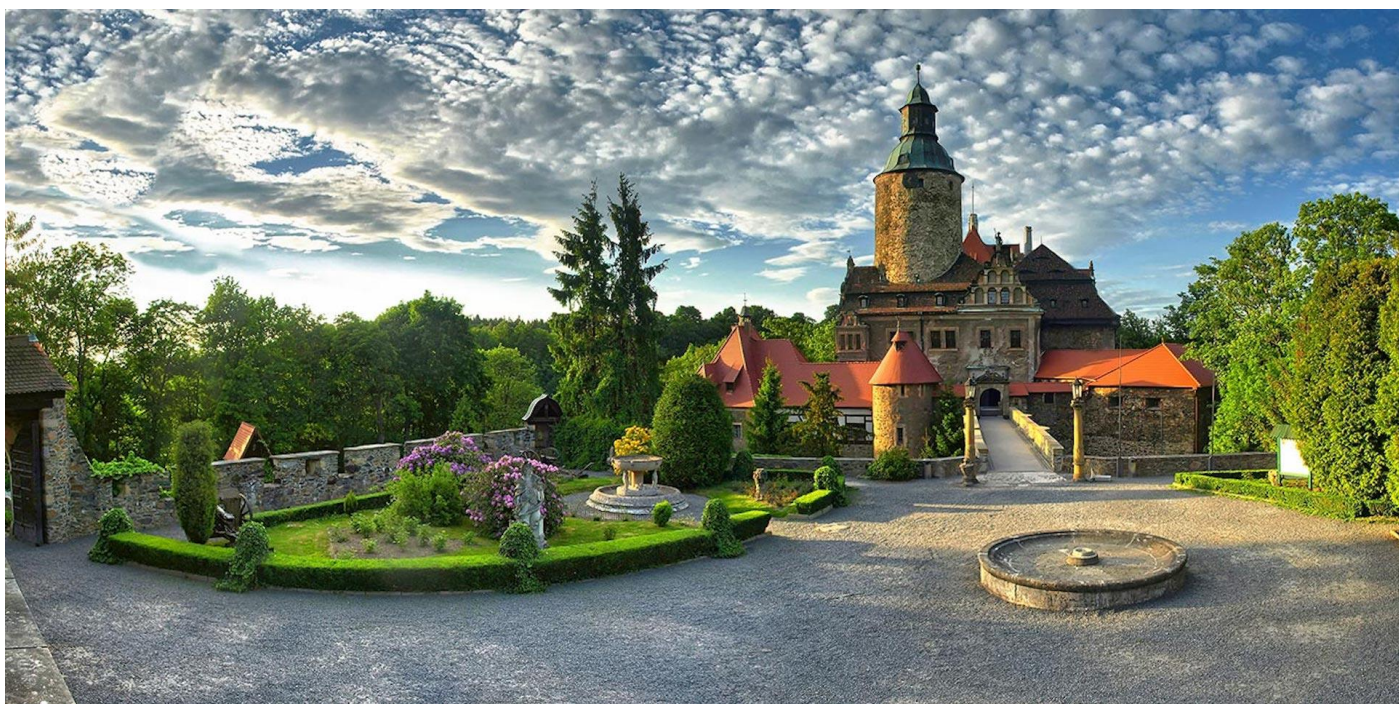
Tschocha Castle – general view, other shot